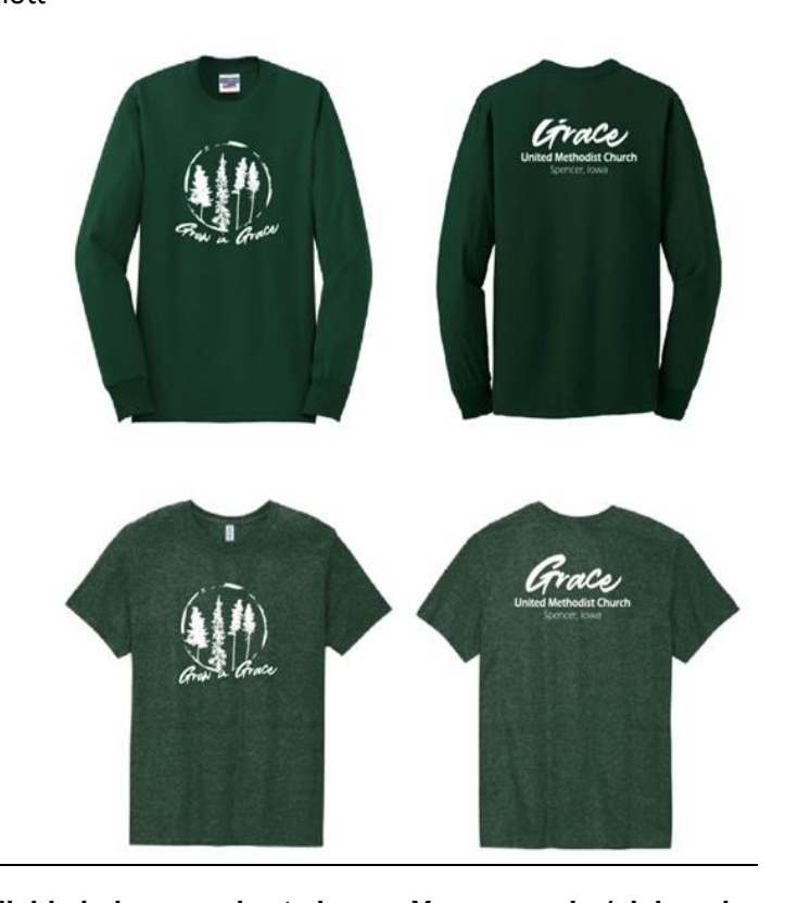
T-Shirts are for sale for $10 each. They are green and available in long or short sleeve. You can order/pick up in the office, or contact Sandy Heerdt or Jane Ingledue.