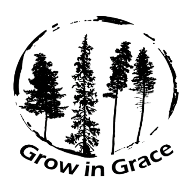
Grow in Grace

Making disciples of Jesus Christ for the transformation of the world.